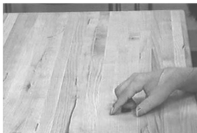
Figure 2. After taping—grasp of pellet-item 7 of Melbourne Assessment.

The Melbourne Assessment evaluates the ability of unilateral arm and hand function and provides detailed information regarding the child's ability and disability. Through measuring change, it appeared to be adequately sensitive to document the acute change associated with wearing the tape. The items in the Melbourne Assessment were applicable to the population for whom it was developed, but it also appears to be an applicable measurement tool in children